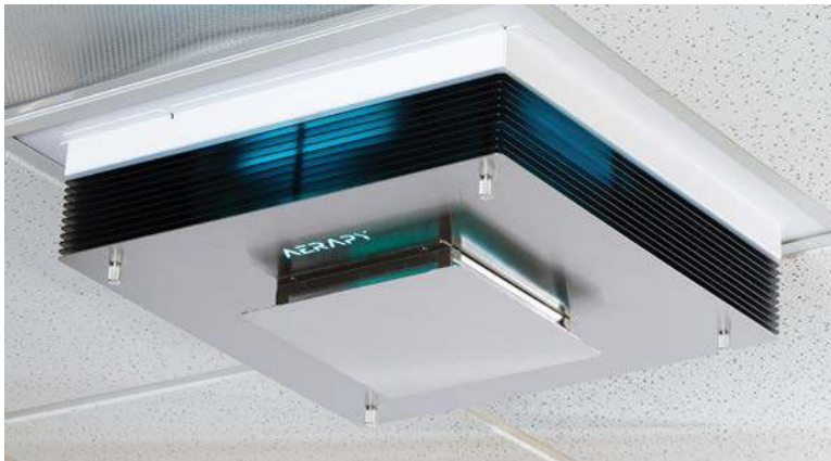
Patent No. US 10,753,626 B2

Our researched, tested, study-backed, and affordable ultraviolet germicidal irradiation (UVGI or UV) equipment harnesses the power of UV-C light to kill pathogens or render them harmless. UV is a well-established means of disinfection used to help prevent the spread of infectious diseases.